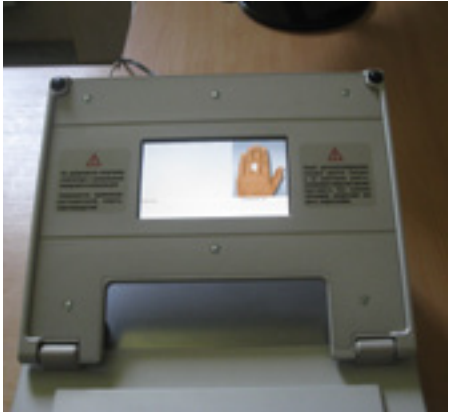
Fingerprints scanner procured by IOM

than by manual checks. Moreover, the dactyloscopic scanner completely automates the data collection process and ensures roll-capturing quality control. This provides for reliable identification of migrants, which can help in avoiding the unjustified repeated detention of the same individual. The SMS’ and SBGS’ preference for this very system was motivated by the fact that the Ministry of Internal Affairs of Ukraine has been successfully using the same type of equipment for several years. It is planned to procure and install similar equipment in new SBGS- and SMS-managed temporary holding facilities for irregular migrants, currently under construction, as well as develop a powerful and comprehensive data base on third country nationals.