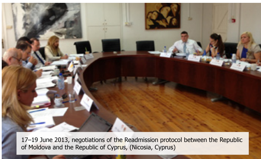
17–19 June 2013, negotiations of the Readmission protocol between the Republic of Moldova and the Republic of Cyprus, (Nicosia, Cyprus)

The Moldovan Deputy Minister of Interior officially noted the importance of IOM's support in facilitating the discussions, and thus contributing to the implementation of the EU-Moldova Visa Liberalization Action Plan.