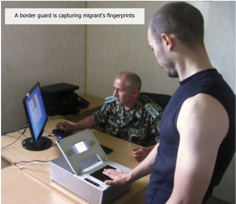
A border guard is capturing migrant's fingerprints

Computers, “Papilon” dactoscanners and the Automated Dactyloscopic Information System (ADIS) “Dacto-2000” were procured by IOM under a previous EU-funded project, SIREADA. Two out of the four sets of equipment were transferred to the SBGS for their use in border detachments, and the other two sets were delivered to the State Migration Service (SMS) to be used in Migrant Accommodation Centres (similar trainings for selected SMS staff are scheduled for the second half of this year). The equipment was procured not only to facilitate the creation of an electronic data base on third country nationals, but also to ensure effective information exchange on apprehended and detained irregular migrants between the leading migration authorities in Ukraine. ADIS allows for the creation, storage and operation of an electronic database. It also automates the dactyloscopic identification process to solve a wide range of issues, including maintenance of dactyloscopic databases and identification based on finger and palm prints. It is obvious that identification through ADIS is much quicker and effective